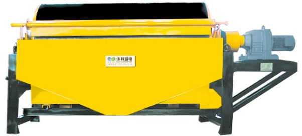
LI ^DBB-HBCHDCI G@E