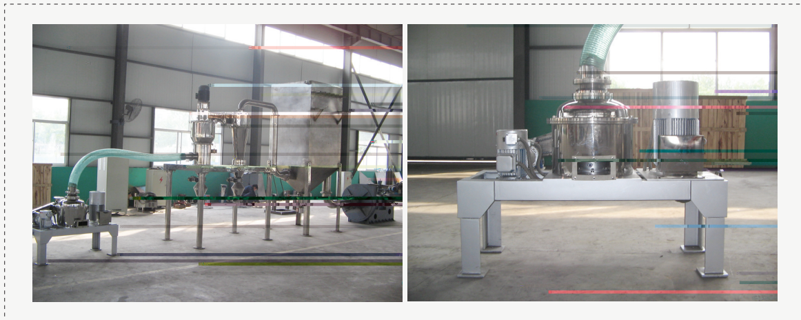
(Operation of the equipment at site)